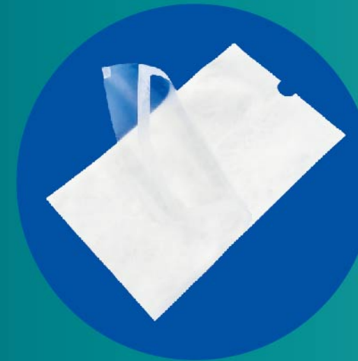
Sterilization Tyvek® Pouch