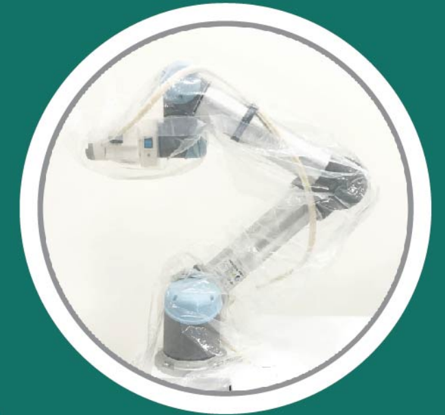
Robotic Arm Drape