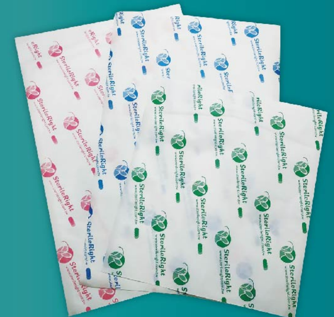
Customized printing, sizes and specifications supplied upon request

Authorized converter of DuPont™ Tyvek® Tyvek® is DuPont's trademark.