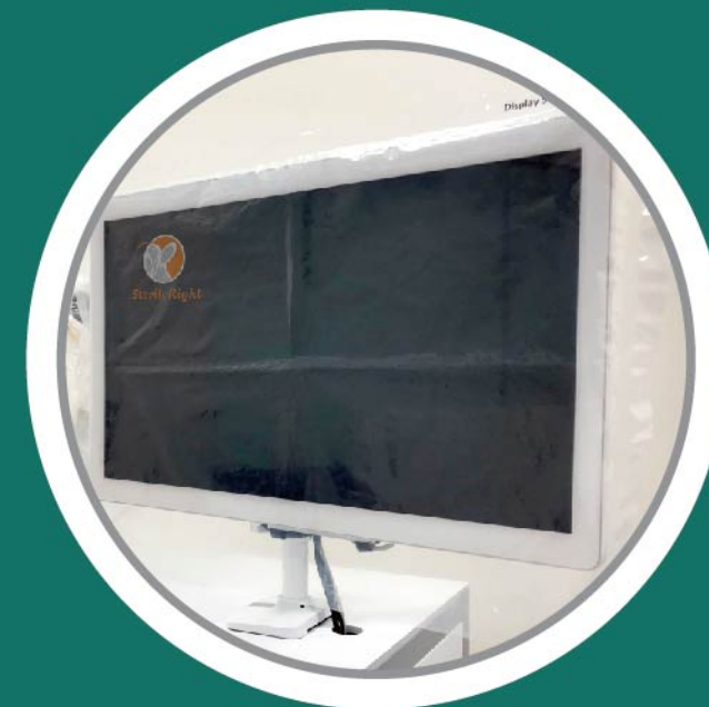
Display Screen Drape