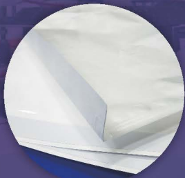
Self-seal Steam Pouch

Produced in an ISO 7 (class 10,000) cleanroom